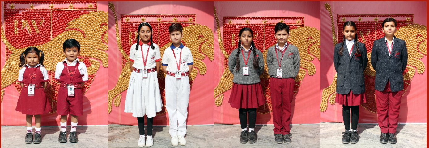
SUMMER UNIFORM Mon, Tue, Thur, Fri (1 Apr - 31 Oct)